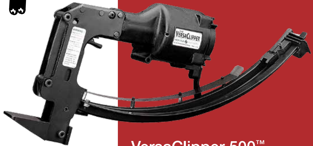
VersaClipper 500™ – strip fed